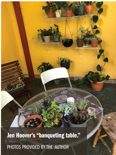
Jen Hoover's "banqueting table."