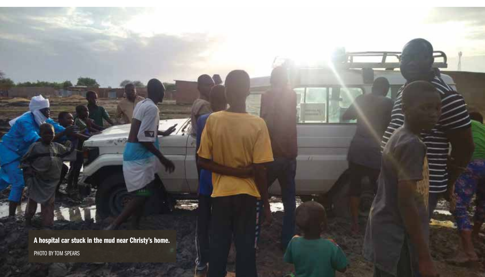
A hospital car stuck in the mud near Christy's home.